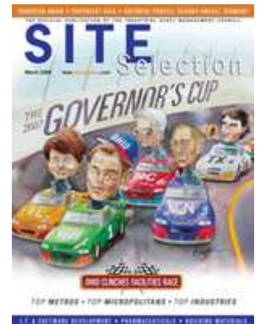
Left: Governor Ted Strickland and Ohio House Democratic Leader Joyce Beatty hold the Governor's Cup Award from Site Selection. Right: The magazine cover honoring Ohio.