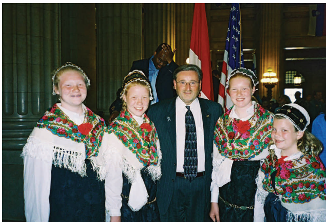
State Representative Kenny Yuko celebrates Cleveland Slovenian Day at Cleveland City Hall.