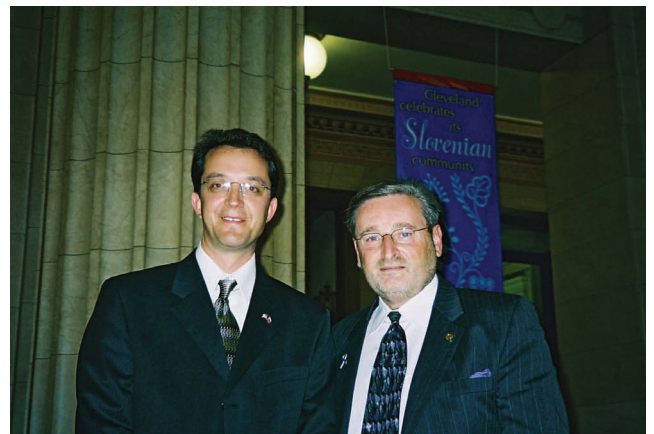
State Representative Kenny Yuko presents a commendation to Zvone Zigon, Consul General for the Republic of Slovenia in Cleveland, in recognition of Slovenia’s 15 years of independence.