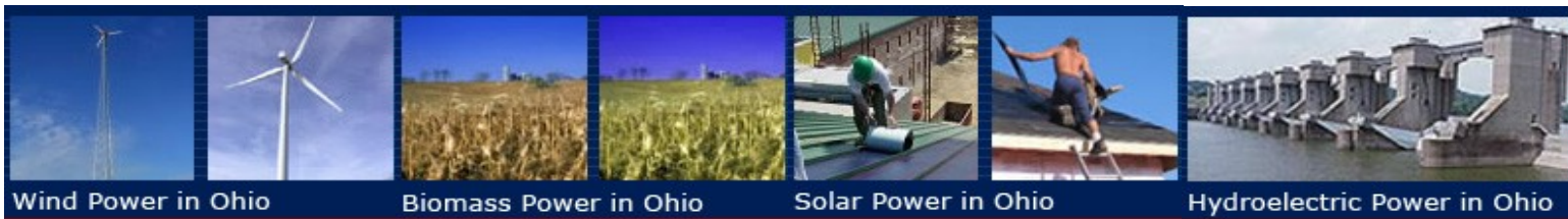
Wind Power in Ohio

These initiatives are strongly supported by our government leaders in Ohio. The Ohio Department of Development's Ohio Energy Office administers $3.5 million in state grants for solar hot water systems and wind technologies, under what is called the Advanced Energy Fund. The grants provide support for the distribution and advancement of energy technologies in the service areas of one of Ohio's four participating electric distribution companies. These grants are for smaller-scale consumers in an effort to stimulate Ohio's market for smaller wind and solar thermal industries. They complement the manufacturing efforts across Ohio, aiming to attract the high-skilled jobs of a new energy economy.