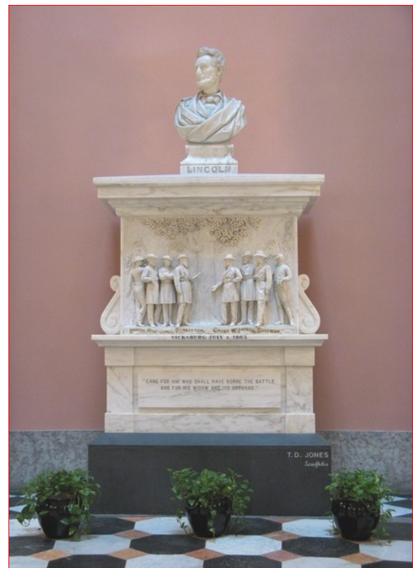
The Lincoln Vicksburg Monument at the Statehouse

For more information about the special Lincoln Bicentennial events at the Ohio Statehouse, visit www.ohiostatehouse.org .