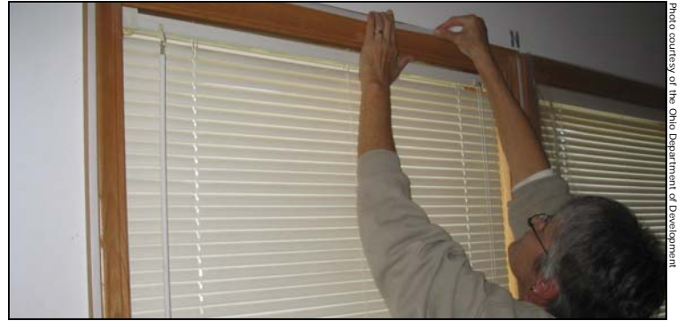
This homeowner is weatherizing her windows by installing plastic sheeting. For more money-saving energy tips, visit the Dept. of Energy's Web site at www.energysavers.gov

By following a few simple steps, Ohioans can take an active role in keeping their energy bills low this winter. Here are a few of the program's suggestions, which are also available on the PUCO Web site at www.puco.ohio.gov .