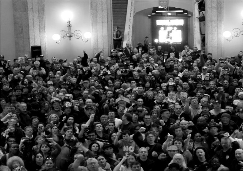
Opponents of SB5, including firefighters (below, right) visit the Statehouse in Columbus.

Senate Bill 5 seen as an attack on the Middle Class