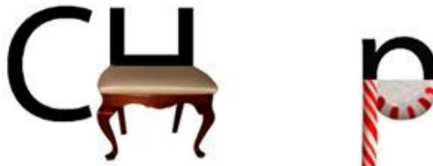
Above is an example of new innovative approaches for helping children with Dyslexia: associate letters with their appropriate sounds.

The goal of the pilot project is to demonstrate and evaluate the effectiveness of early reading assistance programs for children with dyslexia and to evaluate whether those programs can reduce future special education costs. After three school years, a report will be submitted to the General Assembly with the results